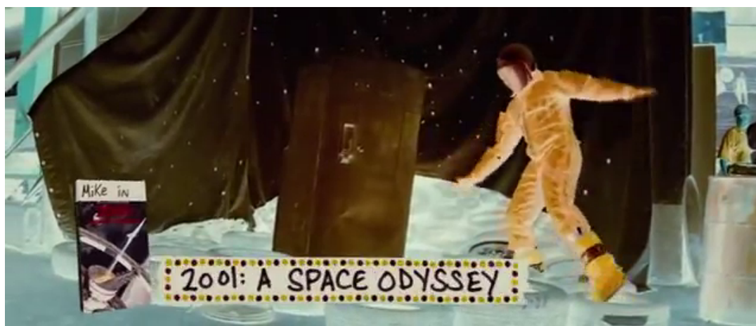
Figure 2: Mike and Jerry’s 2001: A Space Odyssey in Be Kind Rewind (screen capture)

ultimate expression of film nostalgia in the age of digital cinema,” according to Sperb. 16 In Gondry’s film, a pair of video store workers, Mike (Mos Def) and Jerry (Jack Black) must remake movies like Ghostbusters (1984), Rush Hour 2 (2001), The Lion King (1994), and Robocop (1987) after a freak accident wipes out all of the store’s VHS tapes. Hamstrung by shoestring budgets and tight schedules, Mike and Jerry seek to reduce each film to its essence—to a couple of iconic lines or shots—as in a sequence in which the pair tackle films ranging from When We Were Kings (1996) to 2001: A Space Odyssey (1968) to King Kong (1933); Mike recreates David Bowman’s psychedelic encounter with the Monolith in Kubrick’s classic by traipsing towards a small refrigerator filmed in negative, the tires under his feet meant to represent the craters of a planet. Jerry and Mike’s project not only reflects the curatorial bent of 8-Bit Cinema but its nostalgic impulse as well. Sperb’s description of the film as a “powerful meditation not only on what gets left behind during periods of innovation and transition but on the dangers of being obsessed with constant progress and newness for their own sake” 17 could just as well apply to 8-Bit’s modus operandi of making the new look old, the old look old, or the old look older: oldness for its own sake, or for ours.