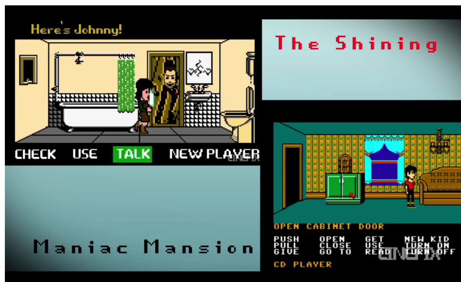
Figure 3: A Maniac Mansion/Shining comparison from “Sneak Peeks & Techniques” (screen capture)

games and those based on games in general. The first type is those in which “we try to make the movie fit and emulate a preexisting game as much as possible,” so that The Shining is modeled on Maniac Mansion , the 8-Bit Blade Runner is modeled on the 1993 SNES game Shadowrun , the 8-Bit Kick Ass is modeled on 1987’s seminal beat ’em up Double Dragon , and Anchorman is modeled on the 1994 RPG EarthBound . 22 The second type of video, Dutton says, includes those movies that don’t fit into “an existing game perfectly ... so we make up an entirely new game.” He cites Pulp Fiction as a representative of this category: “It’s all over the place, just like the movie. We couldn’t really contain it into one game model,” so they included several (e.g. a “dance game,” the bonus round with the adrenaline needle, and a “platformer/shooter”). In both types of video, Dutton, Dutton, and Camarena adapt select sprites from earlier games, using three approaches to creating their art: they “take the preexisting game and we kind of remix it and modify it to match what we want” (e.g. Mega Man becomes Iron Man); they hand draw images before scanning them into Adobe Photoshop; and they occasionally animate over a source photo itself. In all three cases, Dutton offers a brief overview of the pixel art process, encouraging users to engage in their own adaptive activity, their own sweding. Dutton and company’s adaptive play with the films gives way to their users’.